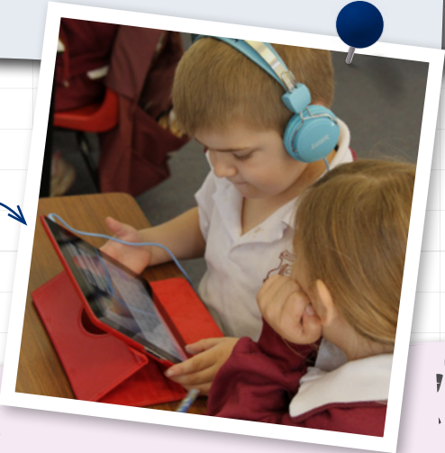
Uses a tablet to sequence steps