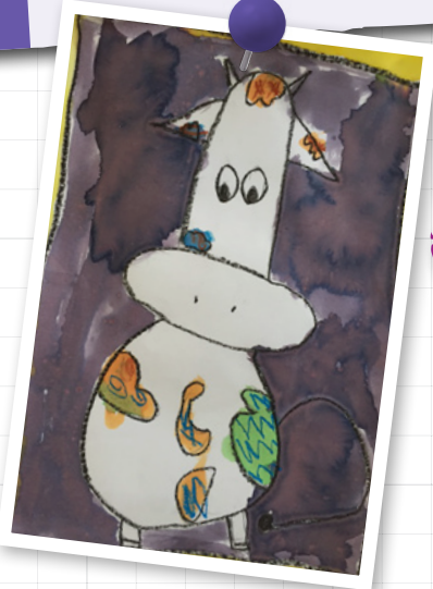
Creates artworks by drawing and painting